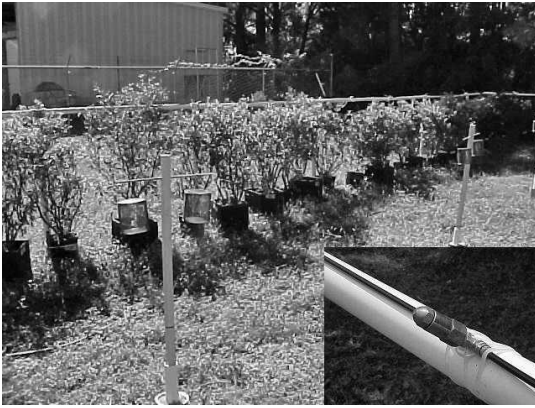
Fig. 1. Partial view of simulated backyard framed by a 1.2-m-high polyvinyl chloride pipe perimeter "fence" with potted wax myrtle bushes. In the foreground are cylindrical wire mesh cages suspended from wooden stakes used for the wire cage bioassays. Inset shows 1 of the 18 Hago spray nozzles that applied synergized pyrethrins from a Model Gen 1.2 MistAway® automatic-timed misting system.